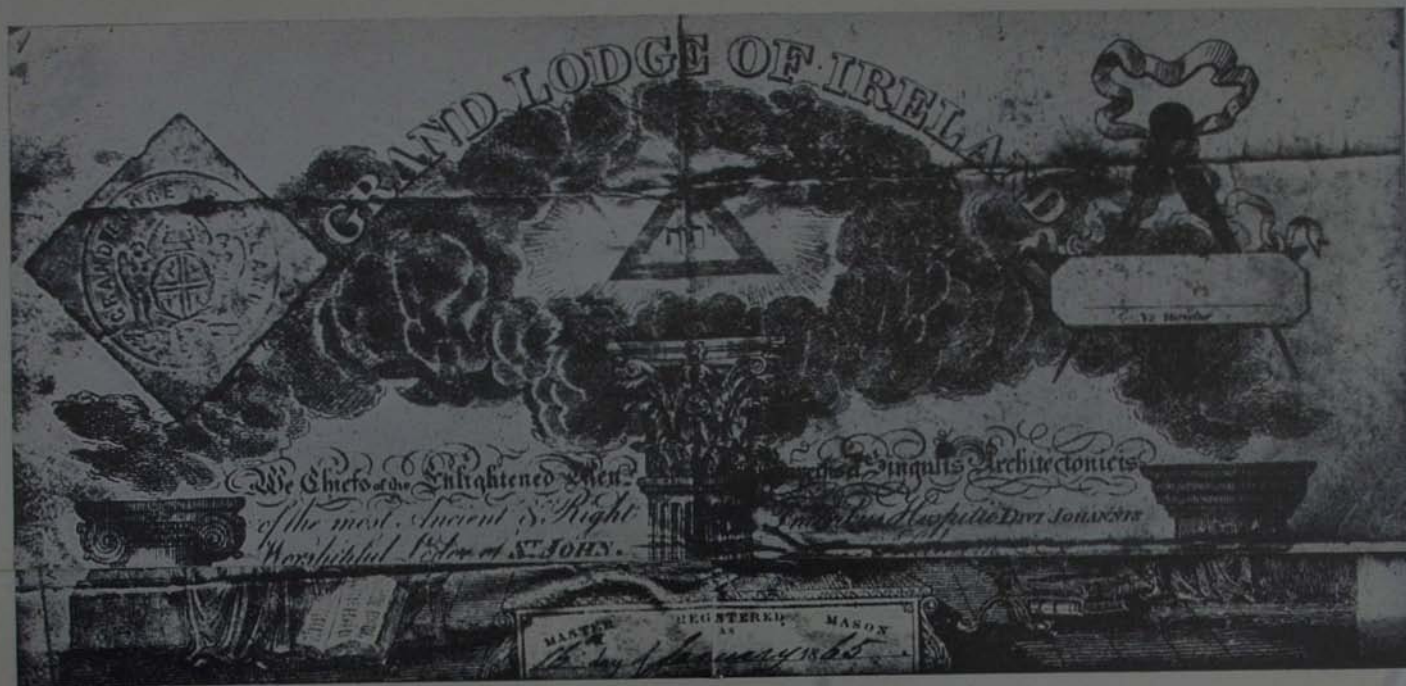
Master Mason's Certificate of the Grand Lodge of Ireland (The name of the member, now deceased, has been for obvious reasons intentionally obliterated).