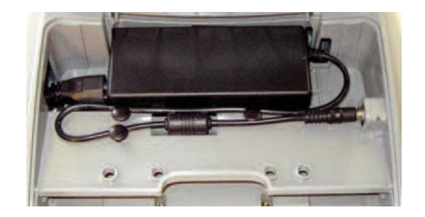
Mounting of the AC power adapter

Place the docking station carefully on the left side with the covering flap open. Route the power supply plug through the opening on the side and place the cable in the lateral recess. Only use the supplied power cable and the supplied power supply unit.