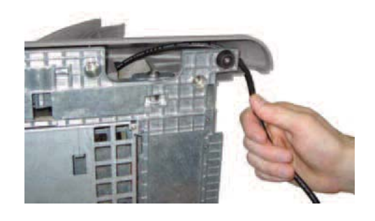
Power cable routing