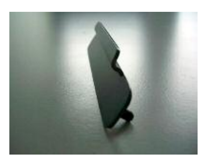
Top view of ISID mounting brackets

The workshop trolley used for Group Tester One, or GT1, can continue to be used for the new workshop system. It is simply a case of having to exchange the brackets for GT1 with the brackets for the Integrated Service Information Display. The brackets were delivered with the Integrated Service Information Display (ISID).