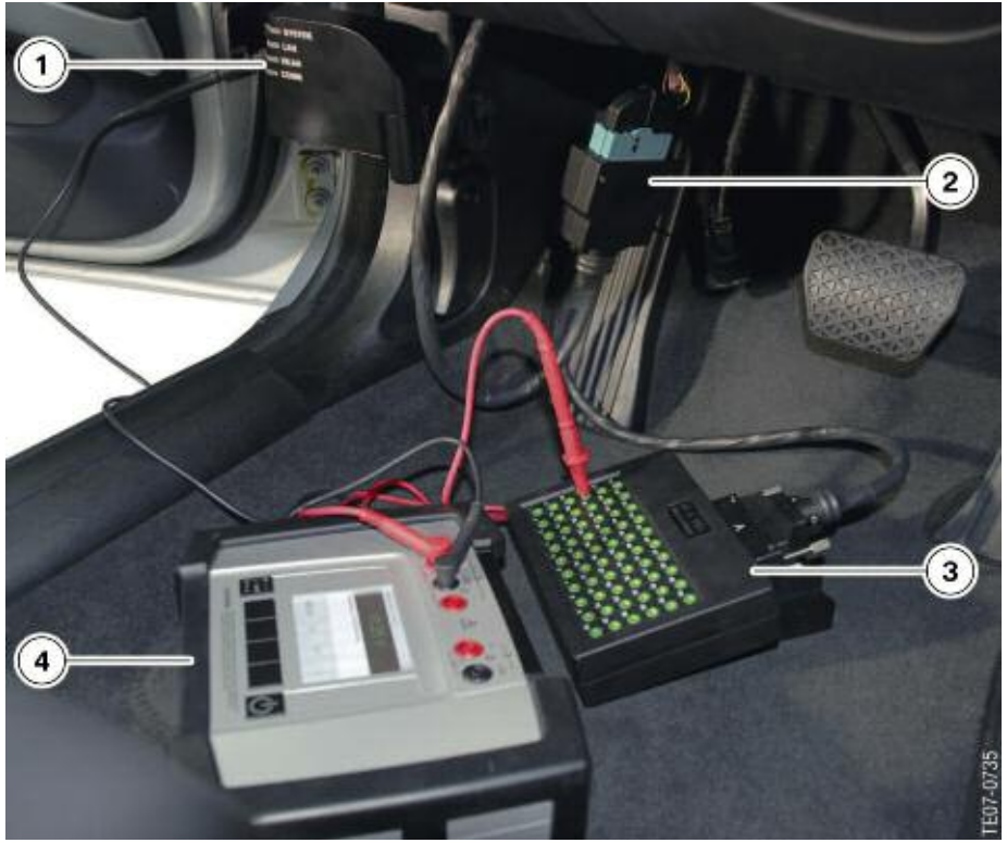
Using the Integrated Measurement Interface Box inside a vehicle

The Integrated Measurement Interface Box also has a USB interface, which will be used for vehicle diagnostics in the future.