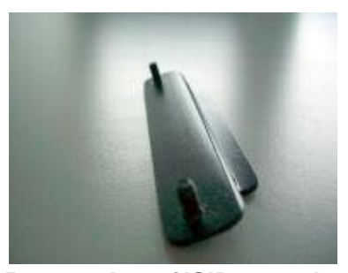
Bottom view of ISID mounting brackets